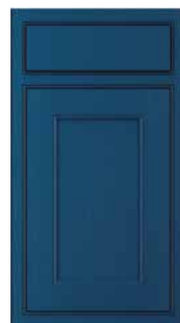
PAINTED PARISIAN BLUE