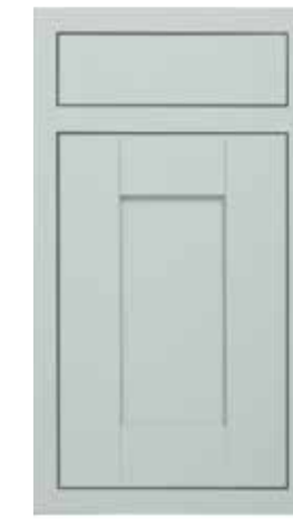
PAINTED LIGHT BLUE