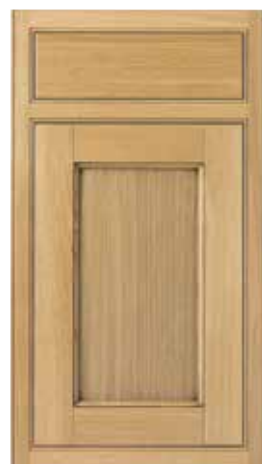
WHITE OAK ANTIQUED