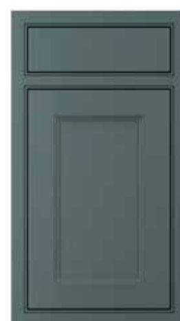
PAINTED GUN METAL GREY

* Any door wider than 400mm is automatically produced as a twin panel door. Sample doors shown above are 400mm wide only and therefore feature a single panel.