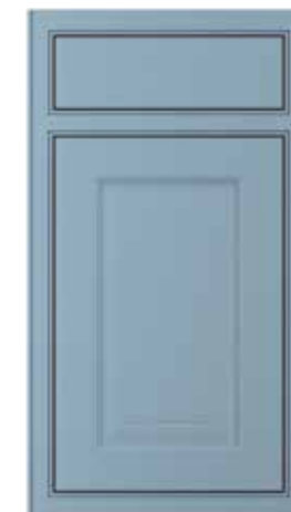
PAINTED SUMMER RAIN