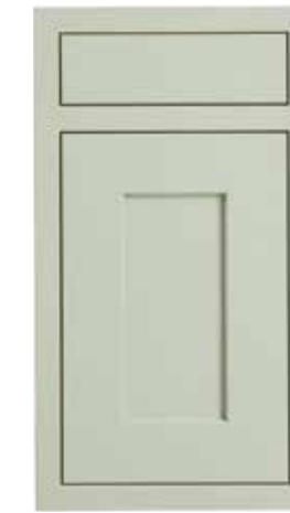
PAINTED SAGE GREEN