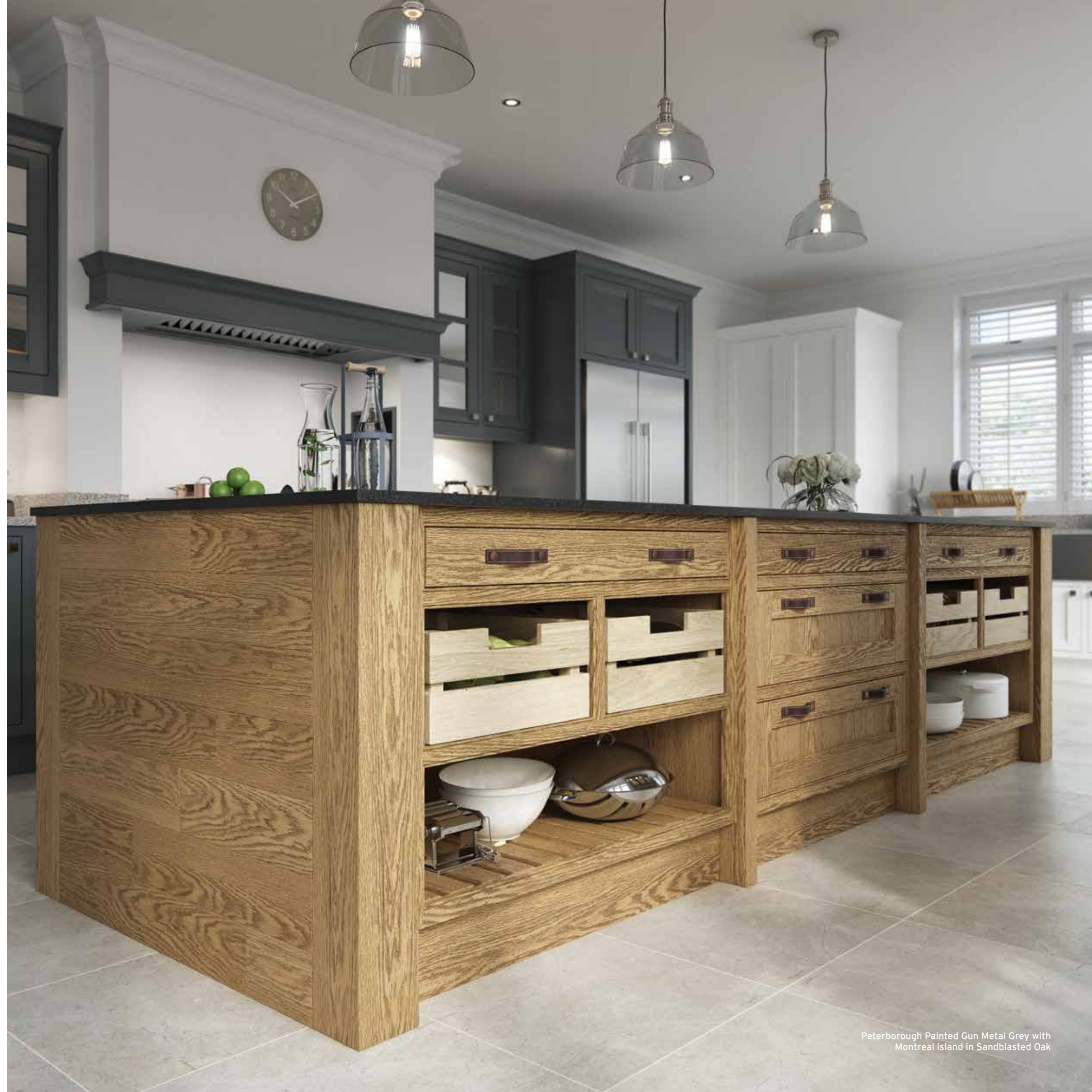
Peterborough Painted Gun Metal Grey with Montreal Island in Sandblasted Oak

Our vast selection of door styles and accompanying accessories are designed to inspire and excite you and, when combined with our specially sourced timbers and palette of paint finishes, you will have a home graced with furniture that is completely original, comprising the highest quality materials and craftsmanship.