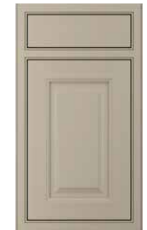
PAINTED STONE GREY