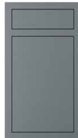
PAINTED DUST GREY