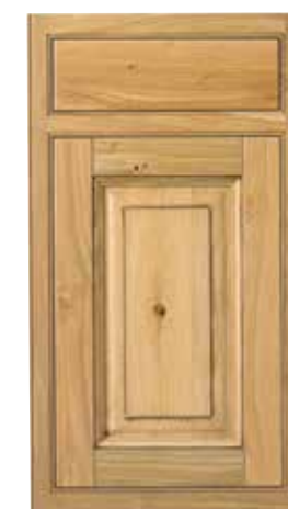
CHARACTER OAK ANTIQUED