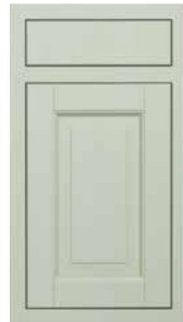
PAINTED SAGE GREEN