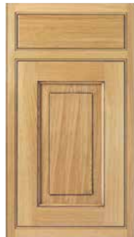
WHITE OAK ANTIQUED

The kitchen shown here features Yorkton Painted Suede (wall & base units, overmantle) with Yorkton Walnut (island, dresser, circular end tables, pull-out trays) and Walnut internal accessories.