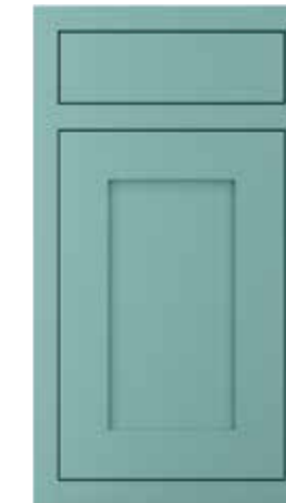
PAINTED LIGHT TEAL