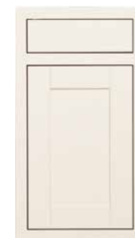
PAINTED WHITE COTTON