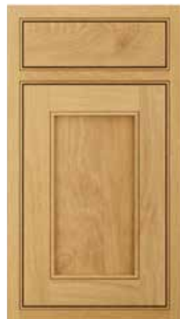
WHITE OAK ANTIQUED

The kitchen shown here features Lawrence Painted Brilliant White (wall & base units) and Parisian Blue (dresser & overmantle) with Oak island, crate drawers, dresser shelf and internal accessories.