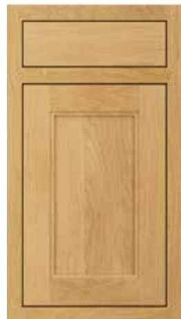
WHITE OAK ANTIQUED

The kitchen shown here features Sutton Painted Shell (wall units, barrel unit, overmantle), Graphite (base units, units above fridge freezer, island) and Sutton Walnut (mantle shelf, breakfast bar with corbals) and Walnut internal accessories.