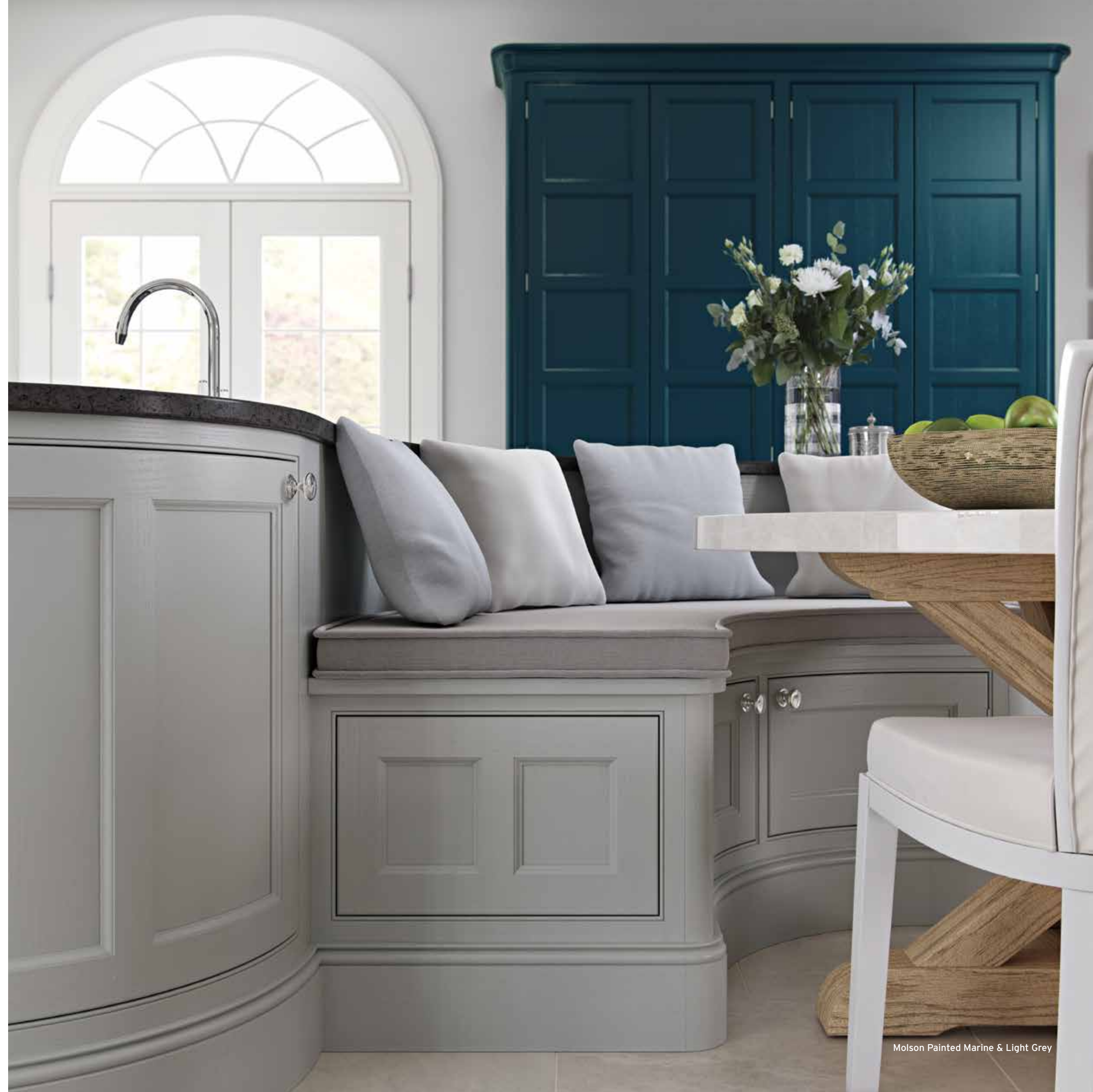
Molson Painted Marine & Light Grey

Here we showcase just a sample of what can be achieved in your home, allowing your imagination do the rest. Our desire is to create what you want without compromise, making your dream home a reality.