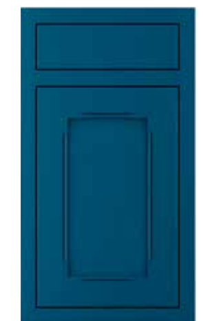
PAINTED PARISIAN BLUE