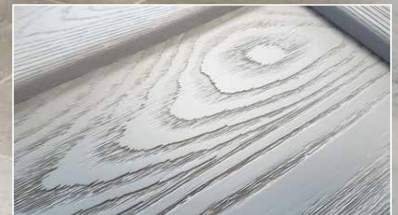
Deep grain detail on painted, sandblasted ash