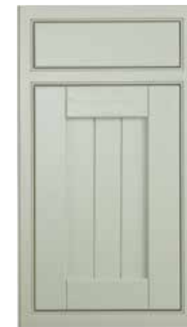
PAINTED SAGE GREEN