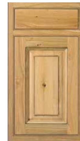
CHARACTER OAK ANTIQUED