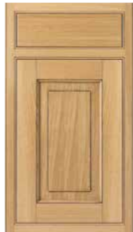
WHITE OAK ANTIQUED

The kitchen shown here features Toronto Painted White Cotton (wall & base units, island) and Light Blue (barrel unit, bench seating).