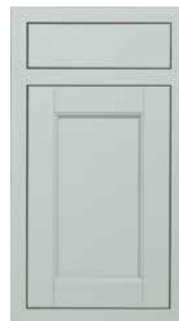
PAINTED LIGHT BLUE