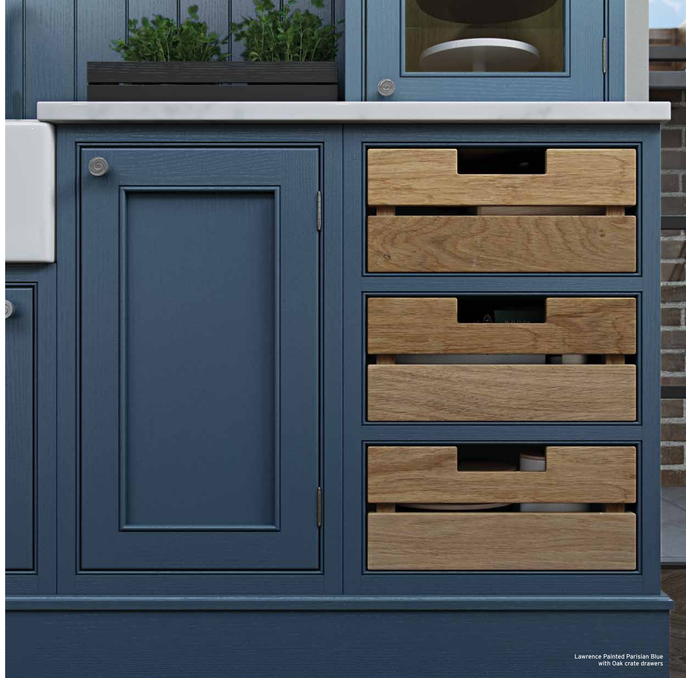
Lawrence Painted Parisian Blue with Oak crate drawers

Finally hinges, catches and handles are applied to provide the ultimate finishing touch.