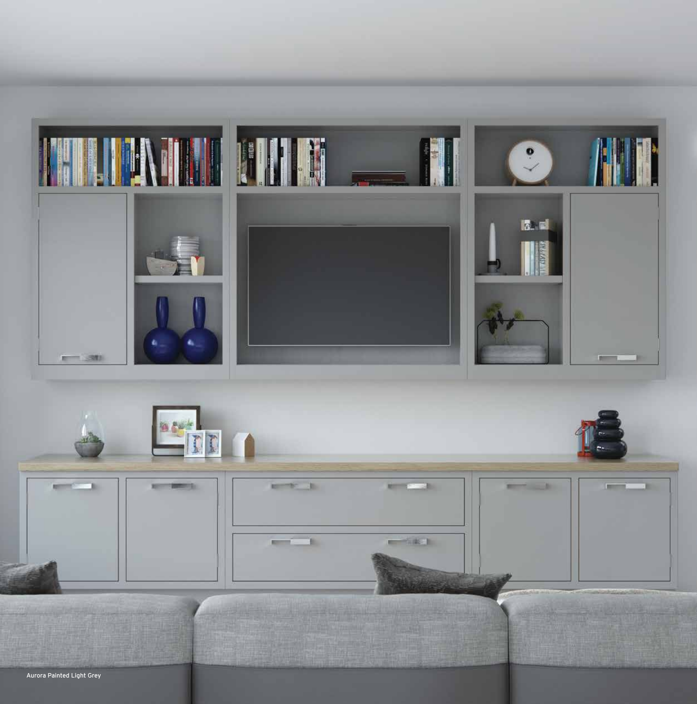
Aurora Painted Light Grey